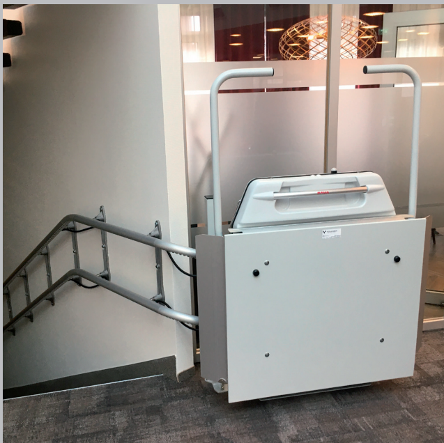
Platform Lift – Curved