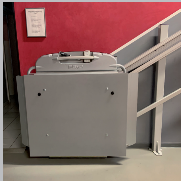
Platform Lift – Straight